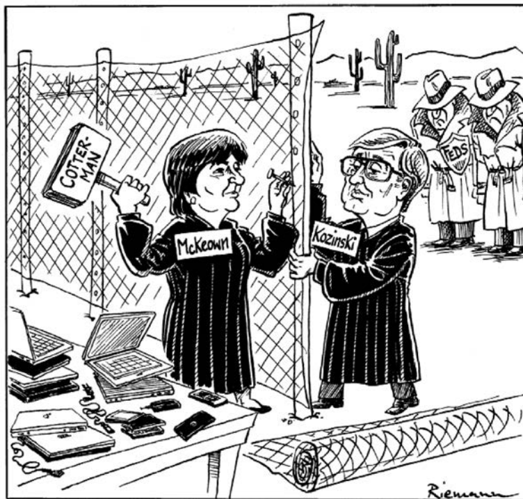
Figure 2: The Cotterman cartoon