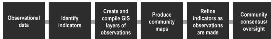
Figure 2. The process of co-development of a community-centered, regional early warning systems with end-user communities as potential first responders.

Incorporating CBONS into preparedness and response frameworks is necessary because it is unlikely that we, as a nation, will be able to equip and mount a centralized set of responses should arctic activity continue to increase at a moderate rate. Thus, incorporating CBONS into ACE can: (1) guide purposeful observations; (2) facilitate successful responses by Alaskan communities; and (3) inform more cost-effective planning and partnerships with local communities by state and federal agencies. This can be accomplished by: (1) helping manage data on observations of change; (2) integrating these data into critical event scenarios which bear realistic meaning to responding communities; and (3) combining engagement, workforce development, and better connections between communities and agencies. These elements enable responses to occur more quickly and effectively.